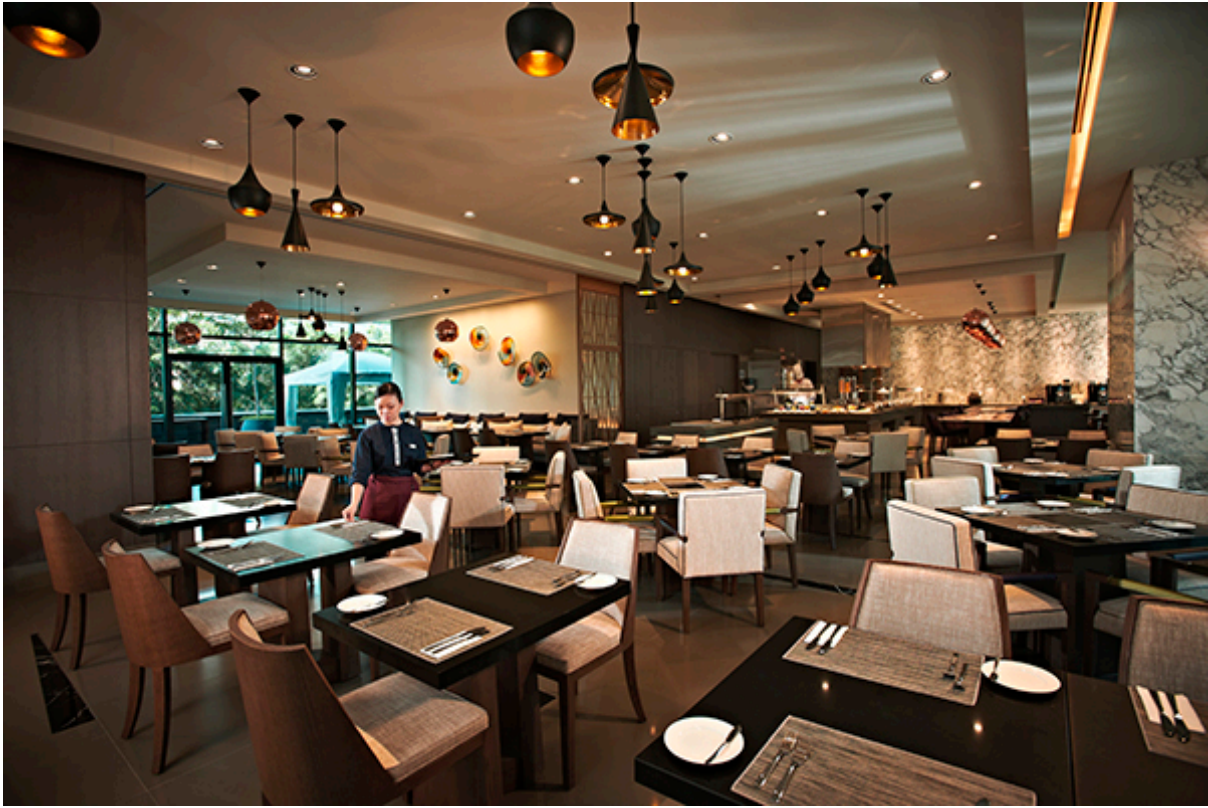
Plate (Level 3)

Plate offers a dining experience that is creative, relaxed and engaging. Located on the same level as the swimming pool on level three, the all-day dining restaurant is surrounded by lush greenery and bathed in natural daylight. A contemporary menu offers generous portions of cuisine choices from local classics to all-time favourites from the grill. Signature items include Chef's Creation Open-faced Wrap , and our popular Wagyu Burger . Other local dishes include our Hainanese Chicken Rice Set and Singapore Laksa . Also notable is the Classic Caesar Salad , served within a cheese ring that is baked crispy golden brown, unlike most salads in a bowl.