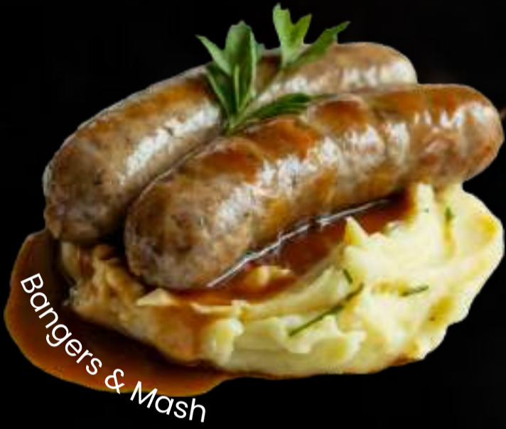
Bangers & Mash