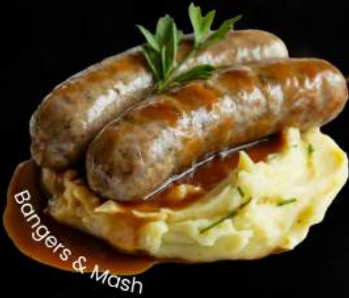
Bangers & Mash